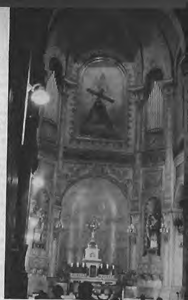
The Church of San Felipe on Madero Ave.

I obeyed, and as I nearly always kneel in some little corner of the church in order not to be seen, I felt at ease that no one would